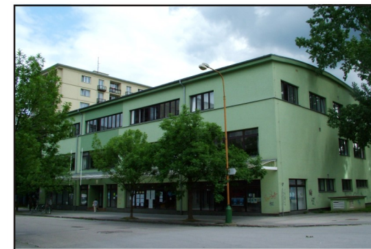
Meeting of the partners in Žilina (11 – 13 June 2014)

The library serves as a barrier – free community centre and public meeting place, offering social, educational, and cultural events for broad public. Krajská knižnica v Žiline is a methodological and coordination centre of libraries within Self-Governing Region of Žilina.