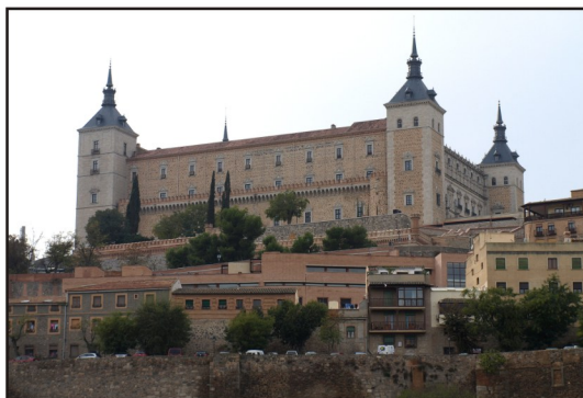
Meeting of the partners in Toledo (19 – 21 June 2013)

The library is an attractive physical and virtual meeting place. The main part of users is retired, students, children, unemployed, social and economic disadvantaged people, immigrants and people with special needs.