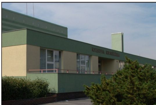
Meeting of the partners in Kroměříž (11 – 12 April 2013)

The library It provides free access to information and services for all the public and educational programmes for the unemployed and for seniors and the disabled (any kind of physical disability).